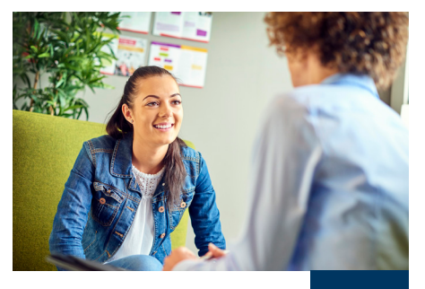
DROP-IN: YOUTH Details JOB CONNECTION on back

Free 1-on-1 career counselling to determine if you are eligible and interested in the YJC program. Sign up today to schedule your appointment.