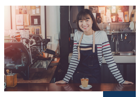
CUSTOMER SERVICEDatesEXCELLENCEon back

Join us for a full day of customer service excellence training and learn how to delight customers across any industry.